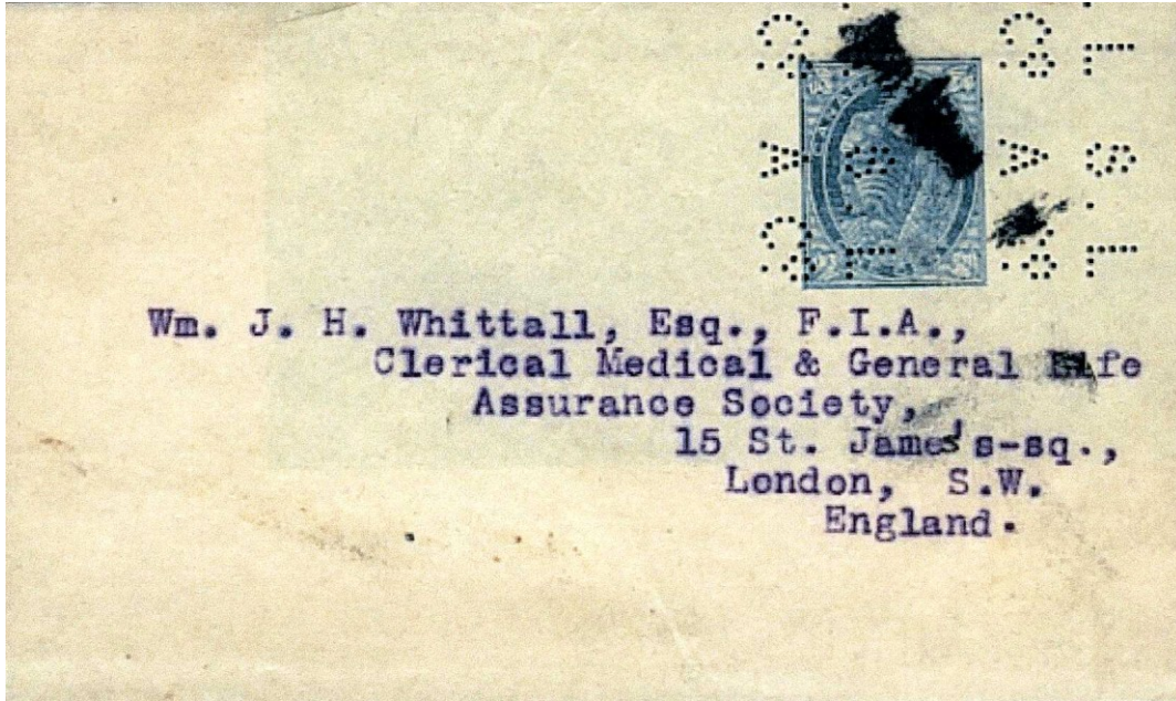
Earliest Reported Canadian Perforated Stationery.