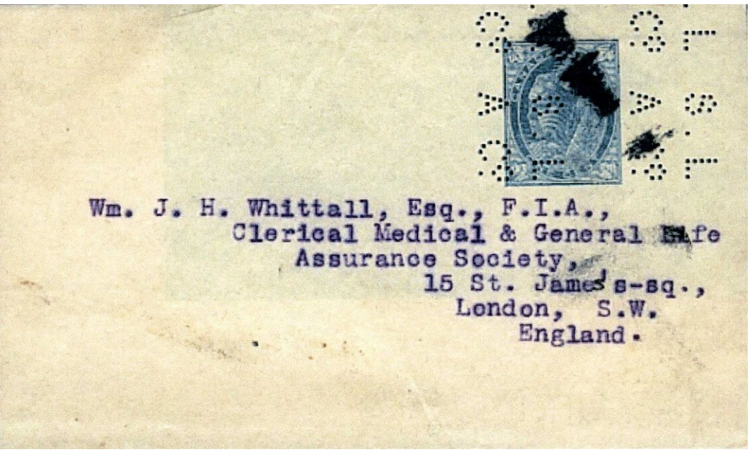
Earliest Reported Canadian Perforated Stationery.

Although no mention has been made of postal stationery in the Post Office regulations, three perforations are found in postal stationery. The Sun Life Assurance Company is the only private company, so far reported, as perforating stationery. The 1897 postal band, 1¢ Q.V., Webb's W6 was perforated S.L/ACo (S15). The 1938 1¢ George VI issue postal bank was perforated OH/MS with both the 5-hole (08) and 4-hole (09), Webb's DW20b and DW20c respectively.