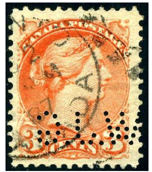
Earliest Reported Canadian Perforated Stamp, dated 1887

According to Post Office records, 80 applications have been approved since 1910. For a detailed listing, see Addendum A. The number in each year is as follows: 1910-twelve; 1911-eleven; 1912-twenty; 1913-eight; 1914-six; 1915-four; 1917-two; 1920-three; 1922-one; 1923-three; 1924-one; 1925-two; 1926-two; 1927-one; 1928-one; 1931-two. Since 1931 there has only been one approval although the regulations remain in force.