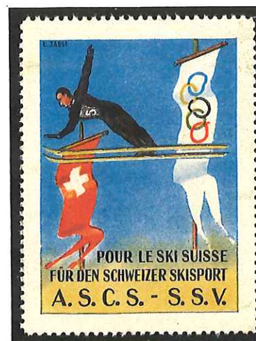
1948 poster stamp

Poster stamps and labels were issued for the following events: