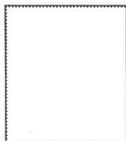
1 Cent Rose

A complete set of the stamps that were issued is shown below. The 1, 5, 10, 12 1/2 and 17 cents were released on July 1, 1859, the 2 cent on August 1, 1864.