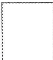
17 Cent Blue