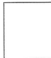
2 Cent Rose