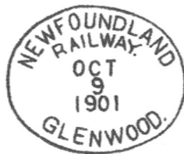
TS-180 Page 82