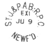
N-98 Hammer II Page 59 (N-100 AIV without outer-ring)