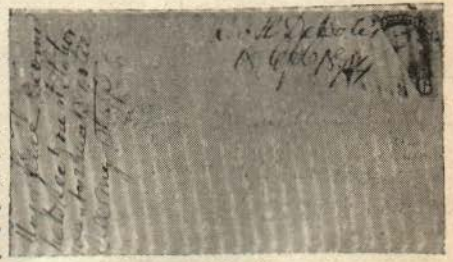
Fig. V From B. C. Binks Collection (Backstamped Annapolis April 1874)

Another conclusion I have reached is that while there has been no record of official sanction for the use of bisects, there are still legitimate regsons why these covers before the 1880s