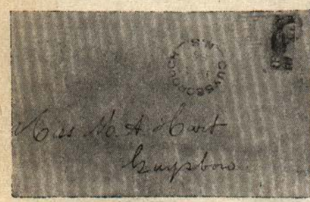
Fig. II

Our librarian cooperated fully by sending me what clippings and other