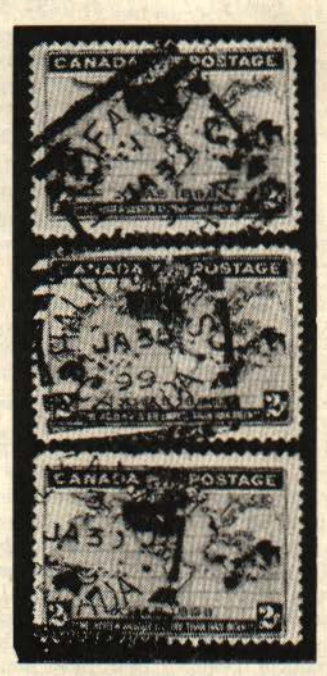
HALIFAX, N.S., JA. 30/99—with numbers 1, 2, 3. The hunt for complete groups of these "clerks' numbers" is keen. This illustration, mentioned in the article, is from the Squared Circle Handbook.

Charlottetown, P.E.I.: 3, 5, also 5 inverted.