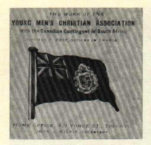
Type II Y.M.C.A. cover. With Canadian flag in red and blue. Known used late (October) in 1900.

Apparenly these representatives moved with the troops as covers are known from several stations. The one illustrated here was used from Belmont, or Orange River. Another is known from Springs, and a letter in my collection tells of Mr. Best having "a song service last night in camp" while located at Bloemfontein.