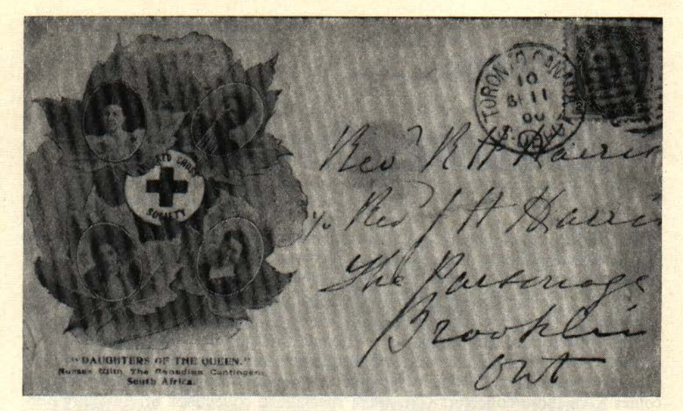
THE ONLY KNOWN EXAMPLE of the patriotic prepared for the Red Cross Society of Canada. The four nurses pictured on this cover are those who accompanied the Second Canadian Contingent to South Africa.