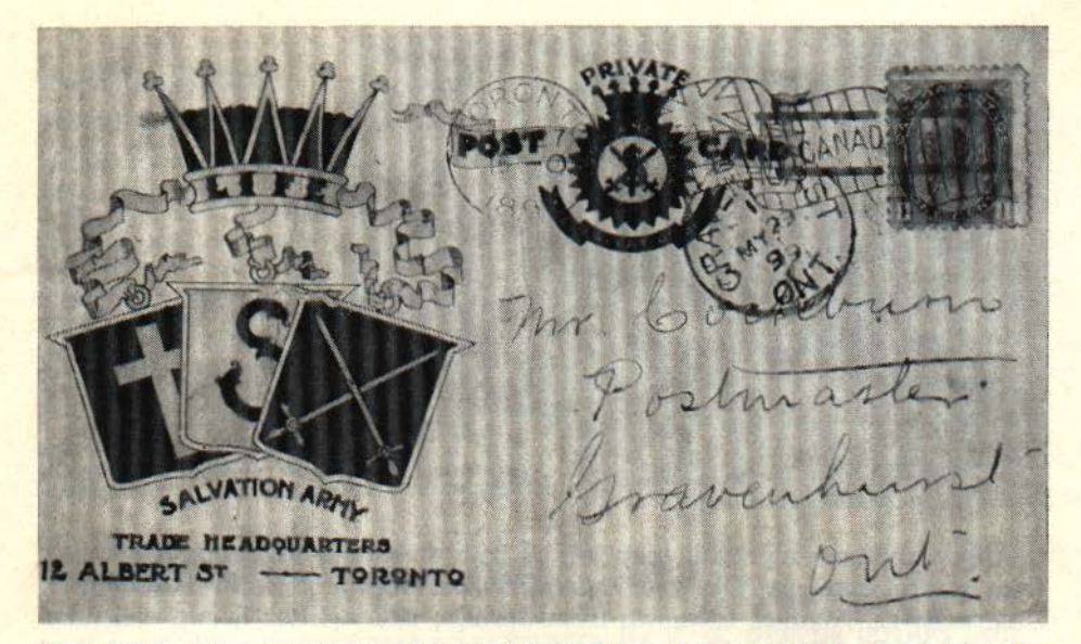
Beautiful three-color patriotic postcard of the Salvation Army. Colors are blue, yellow and red. This particular card was used prior to outbreak of the Boer War—Toronto, May 27, 1899, to Gravenhurst.