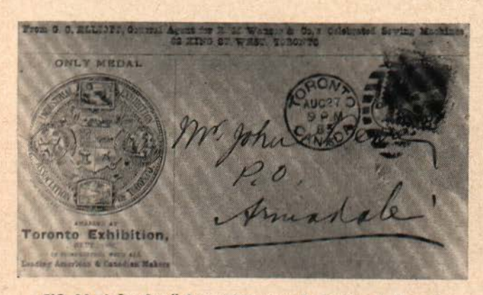
FIG. 16-A fine Small Cents 1883 cover. Design in red. (Lussey)

very few exist, to the writer's knowledge.