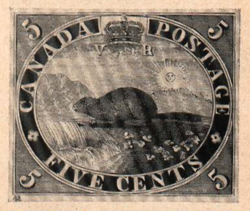
Card No. 42, Canada's 5 cent Beaver, Scott's A8—No. 15, 1859, vermilion.

At the time this card game was created all six of the British North American possessions were issuing their own postage stamps - Canada, New Brunswick, Newfoundland, Nova Scotia, Prince Edward Island, and the "combined" issue for British Columbia and Vancouver Island. However only two have been seen by this collector — those ilustrated here, card #42 for Canada, and card #43 for New Brunswick. Supposedly a card was also issued for Nova Scotia, and if so this was probably #44. If the cards were numbered in sequence then only #40-44 inclusive could have been used by British North American possessions; #39 was assigned to Cape of Good Hope, #45 to Trinidad. If there was a card for British Columbia and Vancouver Island it was likely card #41. Therefore there is a question as to whether or not there was ever a card issued for either Newfoundland or Prince Edward Island.