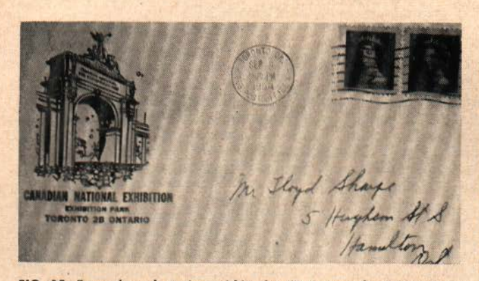
FIG. 15—From the sub-station within the "Ex" grounds. Design is in green. (Sharpe)