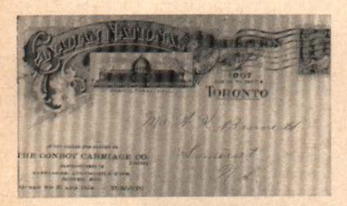
FIG. 19—Design in black showing the Agricultural Hall. (Lussey)