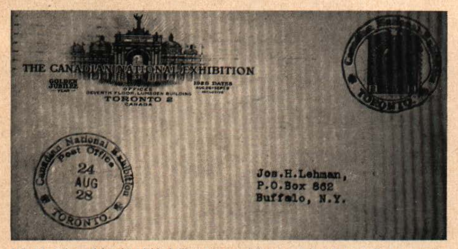
FIG. 13—A beautiful red and black illustration used from special Ex" post office on opening day. Cancellation in bluish purple. (Sharpe)

These envelopes are intended for official correspondence and were not available to the public. They are the rarest of all and