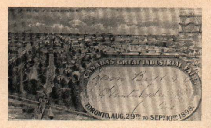
FIG. 14—A very fine cover in black and white; note Crystal Palace at end of long wolk. (H. E. Guertin)