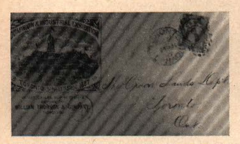
FIG. 18—A very nice 1887 cover with the Crystal Palace picture. Design in black. (Lussey)