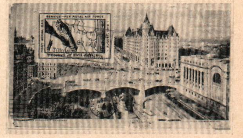
This illustrated cover (formerly from the Jarrett collection) was on the second return flight, August 27, 1918