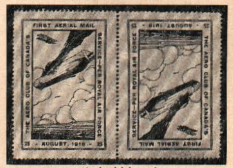
A tête-bêche pair