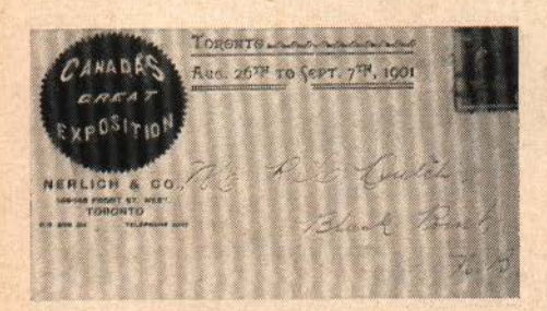
FIG. 20—Design in an orange red. Note name used for the exhibition. (Sharpe)