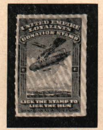
Propaganda label issued during the First World War

The special aerial stamps had been printed by the United Typewriter Co. of Toronto with the use of only one electro. Consequently, all pairs when printed became tête-bêche. The red in the flames over the Zeppelin had been produced by a battered plate in a second run through the presses according to Mr. Fred Jarrett. Perhaps a dozen stamps did not receive the red color