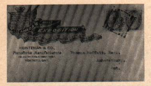
FIG. 17—A 1900 cover with squared circle, York St., Toronto. Design in blue. A very attractive cover. (Lussey)