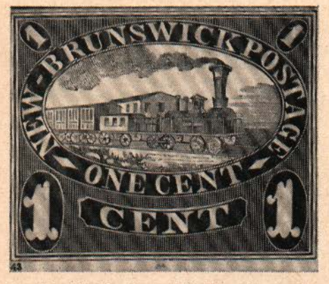
Card No. 43, New Brunswick's 1 cent Locomotive Scott's A3-No. 6, 1860, brown.

Each of these are printed on a soft, thick, wove card, and they measure approximately 83 x 73 mm ( 3\frac{1}{2} x \frac{7}{8} inches.)