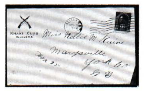
Fig. 20—Scarce cover of Khaki Club in Halifax—First world war printing in brown.