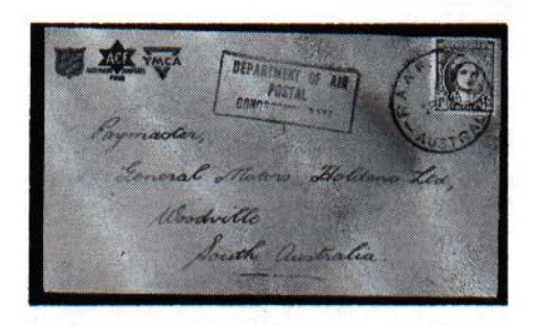
Fig. 26—An Australia cover of the Second World War with a combination of services. Printing is in red.