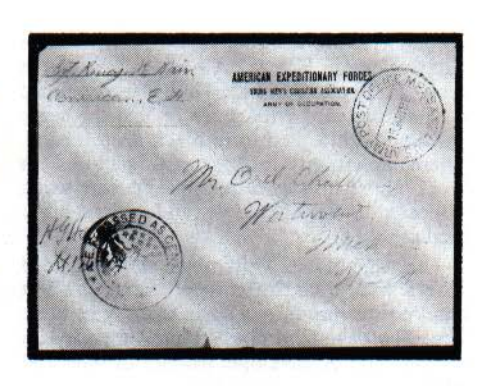
Fig. 25—An Auxiliary Service cover from the America Forces of Occupation in Germany at the end of the First World War. Printing is in black.

I hope these notes have been of some interest and for general convenience I attach a list of various Canadian Services (and as far as possible) an indication of the period of their use.