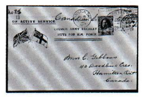
Fig. 18—Scarce Patriotic Auxiliary cover of the First War, printing in blue.

The Salvation Army was also very active but their covers usually only carried the Salvation Army Shield in red in the lower left