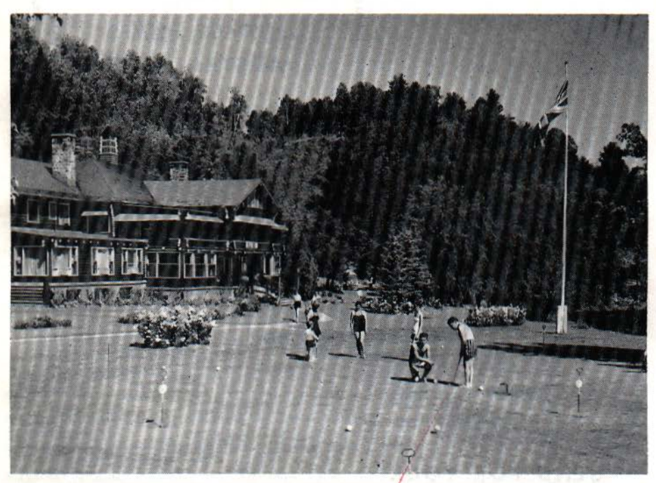
THE ALPINE INN, STE. MARGUERITE STATION, QUEBEC, CANADA Home for the BNAPS Convention, Sept. 26-29, 1962