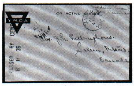
Fig. 13—Scarce Y.M.C.A. post card dated 1917 in red and black.