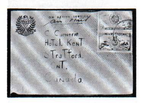
Fig 27—This is a New Zealand cover of the Y.M.C.A. from the New Zealand Forces in Japan.