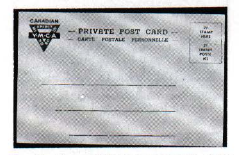
Fig. 15—Scarce Y.M.C.A. post card of the Second War in red and black on manilla card.

The next illustration, Figure 18, is a recent discovery, really a Patriotic of the First War. I rather think it is the same organization as illustrated in Figure 6. It is all in blue.