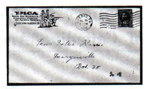
Fig. 16—Scarce Y.M.C.A. envelope of the First World War with printing in black.

Figure 19 is another example of the First World War Organization which I referred to in Numbers 6 and 18. It is black on white paper.