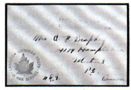
Fig. 22—Printing in green of the 2nd World War Organization known as the Canadian Lutheran Youth.

I said earlier that I would also mention some other service covers and I find that the United States provided quite a few mostly with the Y.M.C.A. triangle and the word "American" above it as shown in Figure 24. There are various types of this Corner Card on different sized and coloured envelopes in many printings and various colours.