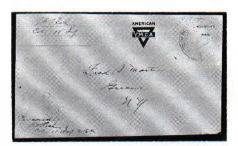
Fig. 24—Typical example of many Y.M.C.A. America covers. The printing and designs are various.

You will also find Y.M.C.A. covers from New Zealand, see Figure 27 . This cover was sent by a number of the New Zealand Forces in Japan. The printing is in red.