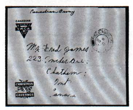
Fig. 12—Special Christmas envelope used in 1941 and 1942 in red and green.

The only card of British production of the First War I have come across shown in Figure 13 . It is in red and black on a white card. Apparently cards are a great deal more scarce than envelopes.