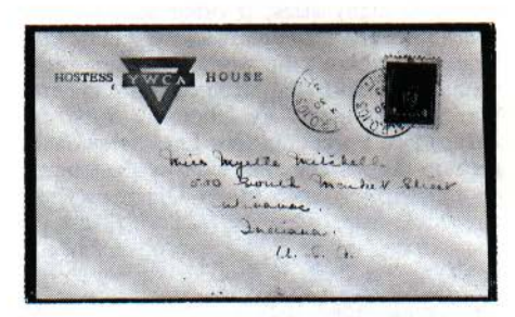
Fig. 17—Y.M.C.A. cover used in Canada only with printing in blue.

Men of the First World War will remember the Khaki Club in Halifax. Figure 20 shows one of these scarce covers which is printed in brown on a white envelope. And men of the Second World War will well remember the Beaver Club in London, England. A sample of this stationery is shown on Figure 21 and is black printing on white envelope.