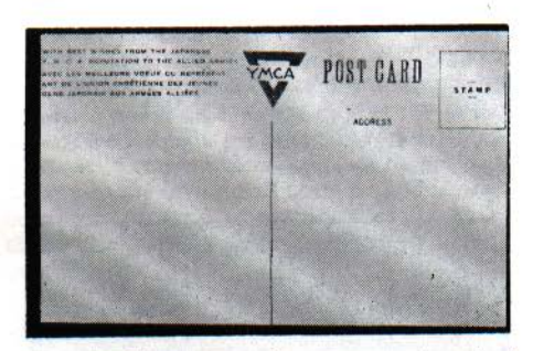
Fig. 14—Very scarce Japanese post card of the First War in red and black.

Then I think we should show the sister organization of the Y.M.C.A. Figure 17 shows a corner card of the Y.W.C.A. Hostess House. It is the only one I have ever seen and I have never seen one used. It is blue on white paper.