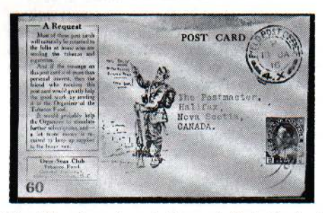
Fig. 23—An acknowledgement Post Card of the First World War Overseas Club Tobacco Fund.

Figure 26 shows an Australian cover with a combination corner card of three services. It seems Australia quite often produced envelopes with a combination of services on them. They, of course, also used separate envelopes for each service. I have a very interesting Australian cover with the Y.M.C.A. triangle as shown in Figure 13 with the word "Australian" above it and below it "With the A.I.F." in blue and red on a white envelope. This cover was used from Lybia, how and why I do not know.