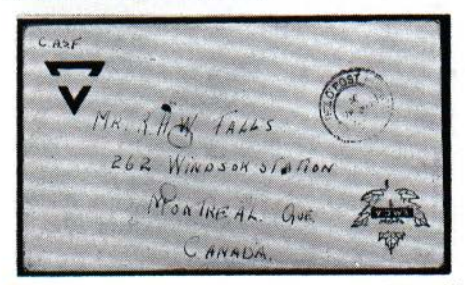
Fig. 11—A scarce misprint of a Second World War Y.M.C.A. in blue and red

Continuing with this type, Figure 11, is a cover that really got me started collecting these. It is blue and red on a white envelope and as you will see it is an item dear to the collectors heart—an error.