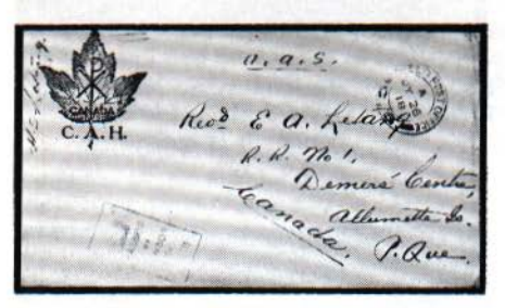
Fig. 19—Scarce Church Army Huts cover of the First World War printing in black.

The Canadian Legion War Services also provided envelopes with a similar type of corner card sometimes in black and sometimes in blue and various sizes on white envelopes. Then there is an envelope, not very attractive, with the words "On Active Service" in the centre at the top. This envelope was apparently a joint effort by the Canadian Legion, Knights of Columbus, Canadian Overseas Y.M.C.A. and the Salvation Army. All I have seen are in black on white envelopes. Another type I suppose what might be called a corner card is Figure 22 of the Canadian Lutheran Youth. The printing on this envelope is in bright green.