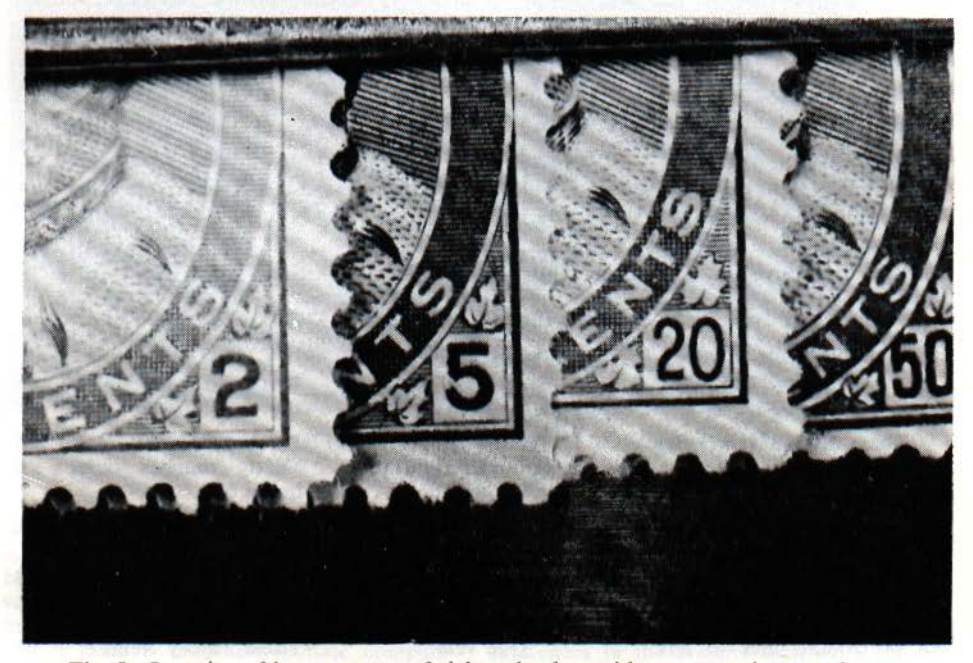
Fig. 5—Location of leaves on top of right value box with respect to inner and outer vertical frame lines. Veins in leaves. Width of value boxes.