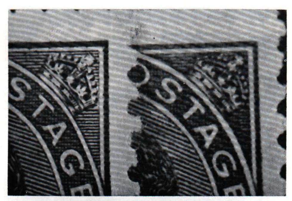
Fig. 4—Thickness and form of letters on 50c and other values. Note especially the "thin" appearance of G on the 50c.