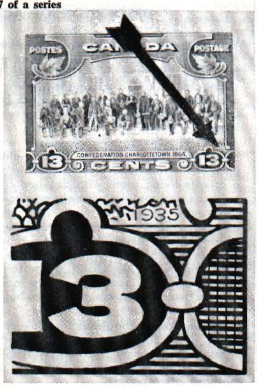
13c Confederation 1935

The 1935 appears in the grass on the right of the stamp just above the number 13. Larkin (958)