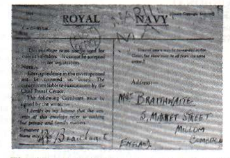
Fig. 23—A new set up for the Navy from the Ken Barlow collection. Second War.