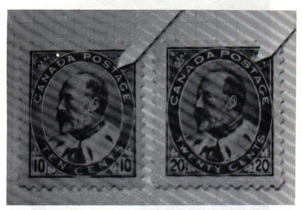
Fig. 2—Comparison of lettering of CANADA POSTAGE on 20c and other values respresentative of the 1c-10c group.

If all parts of the design of the 1c, 2c, 5, 7c, and 10c are compared, the only differences, with one minor exception, that can be found will be in the numerals of value and the lettered denominations. Not so with the 20c and 50c. The most obvious differences are found in the lettering of CANADA POSTAGE on the 20c. Please refer to figure 2. It will be seen that the letters ST on the 20c are directly under the right crown while on the other values STA are under the crown with T being directly under the center of the crown. Also note the letter G. On the 20c the bar protrudes well beyond the curved part. On the other values it is flush with the outer curve. The O of Postage on the 20c is much flattened while it is almost circular on the 10c and other values. Finally, the letters on the 20c