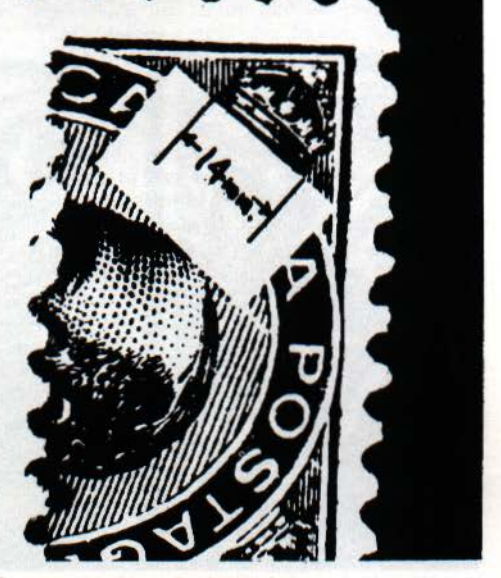
Fig. 3—Width and details of crown on 50c and other values.