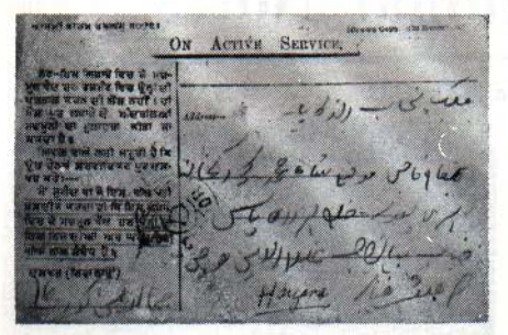
Fig. 15—Used from India First War 1917 all in native language.

paper and printed in black and have Field Post Office cancellations on the back, of the First War.