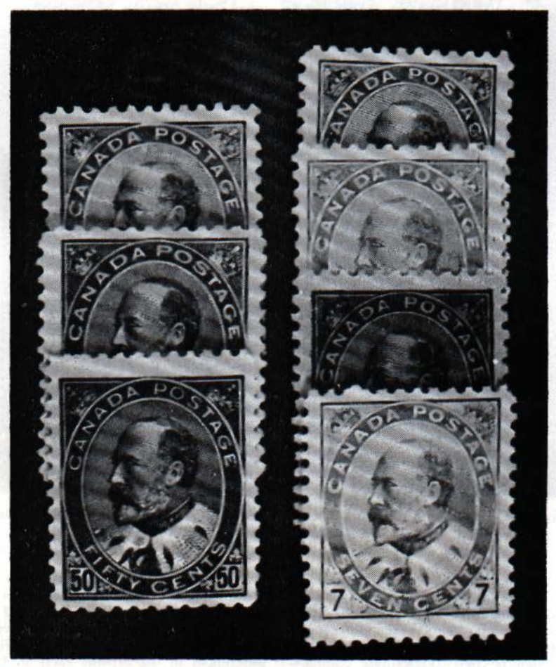
Fig. 1—All values of series, left column top to bottom: 10c, 20c, 50c; right column top to bottom: 1c, 2c, 5c, 7c.

26 where different dies were used to produce the 1c, 2c, and 3c. There are quite minor in difference and not listed in Scott, Holmes, or Gibbons, Die differences are again encountered in the 1930-31 "Maple Leaf" issue on the 1c and 2c values. Then with the last King George V issue we note