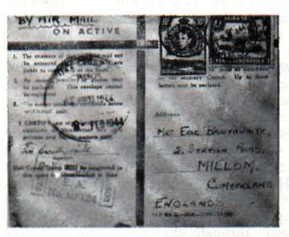
Fig. 19—A new set up from Uganda out of the Ken Barlow collection.

Figure #19 is also a new one used in 1944 from Uganda on the back is E. A. A.P.O. 87 cancellation. The printing is a bright green and the paper white. I take it to be the work of a private firm from the legend at the lower right which reads D.P. & S.Ş.-5856-1/43-15,000.