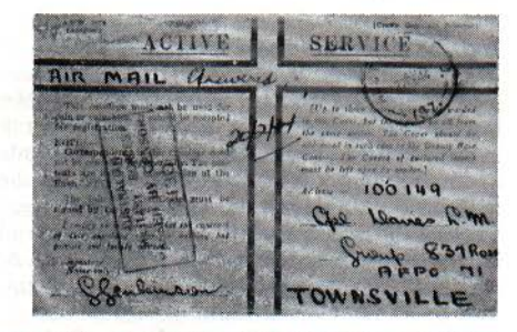
Fig. 18—From the Ken Barlow collection an Australian production.

Figure #18 shows a new set up from Australia used in 1944. The legend in the upper left read A.F.W. 3078 (Adapted) in two lines. The paper is a light buff and the printing in green. I classify this as an Australian production. In many respects it is a good deal like figure #9. Another sentence has been added to the instructions in the right hand box — "The covers of enclosed letters should be left open by sender," and instead of BASE CENSOR it now reads DEPUTY BASE CENSOR.