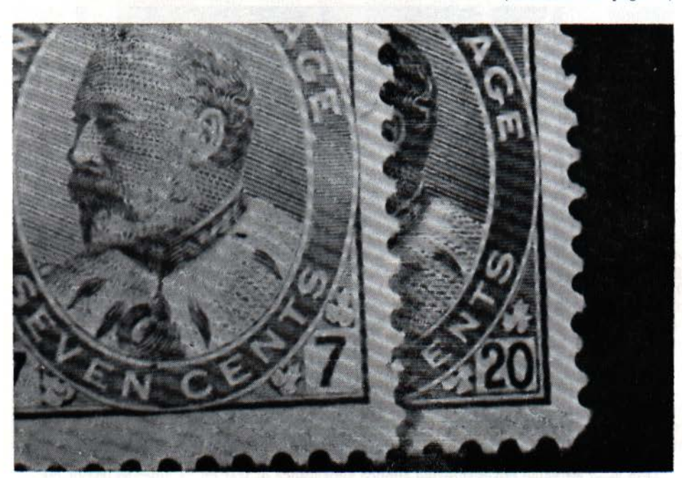
Fig. 6—Comparison of right leaves above value boxes on 7c and 20c.