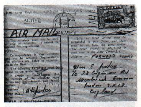
Fig. 14—A very interesting cover of a new type from Ceylon from the E. Lorenson collection.

The fourth cover is a real new find see figure #14 (I have continued the numbers