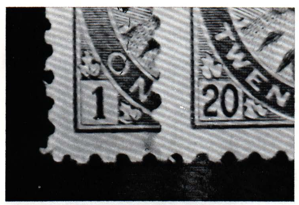
Fig. 7—Left value boxes and leaves on 1c and 20c