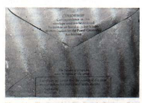
Fig. 21—Shows the back of figure #20.

and I am told Africander. Used in 1943 to 1945 from copies I have seen it seems to be a government production from the legend upper right — M.F.F. (In) 2.