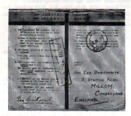
Fig. 22—From the Ken Barlow collection a new one in two languages,