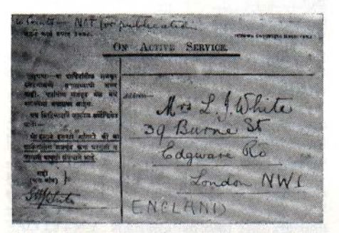
Fig. 16—A First War 1918 cover from India.