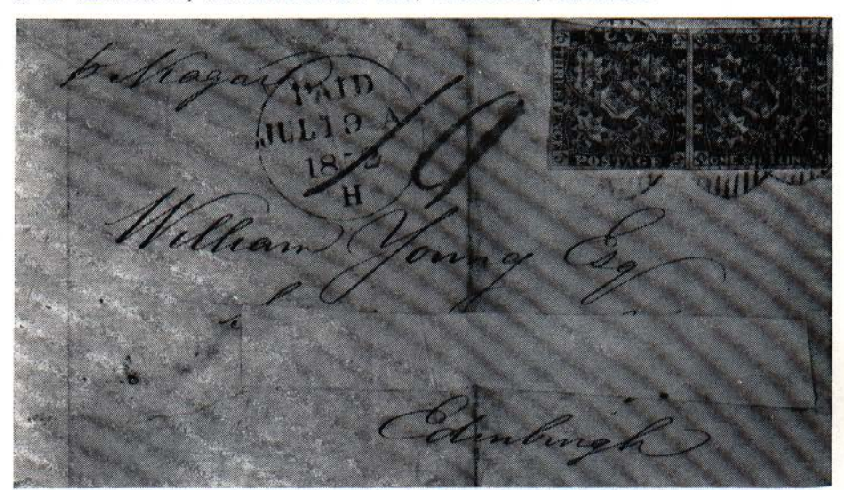
A 3d. and 1s. Nova Scotia prepaying the 1s 3d rate to the United Kingdom dated 1852. Manuscript "p. Niagara" and '10' pence sterling British claim.