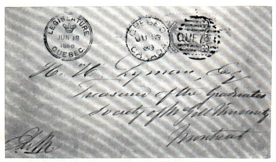
A rather uncommon Quebec duplex cancellation on an official cover dated Jun 18, 1880