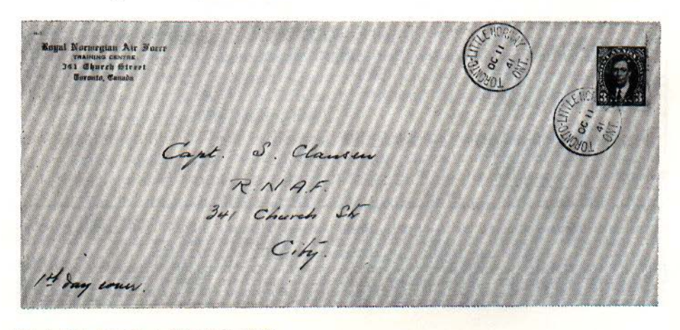
Illustration 1: First Day Cover, October 11, 1941 — two days after the subpost office was established at the foot of Bathurst St. in Toronto, then the home of he Norwegian Air Force.

Following the closing of the Toronto-Little Norway office another was opened