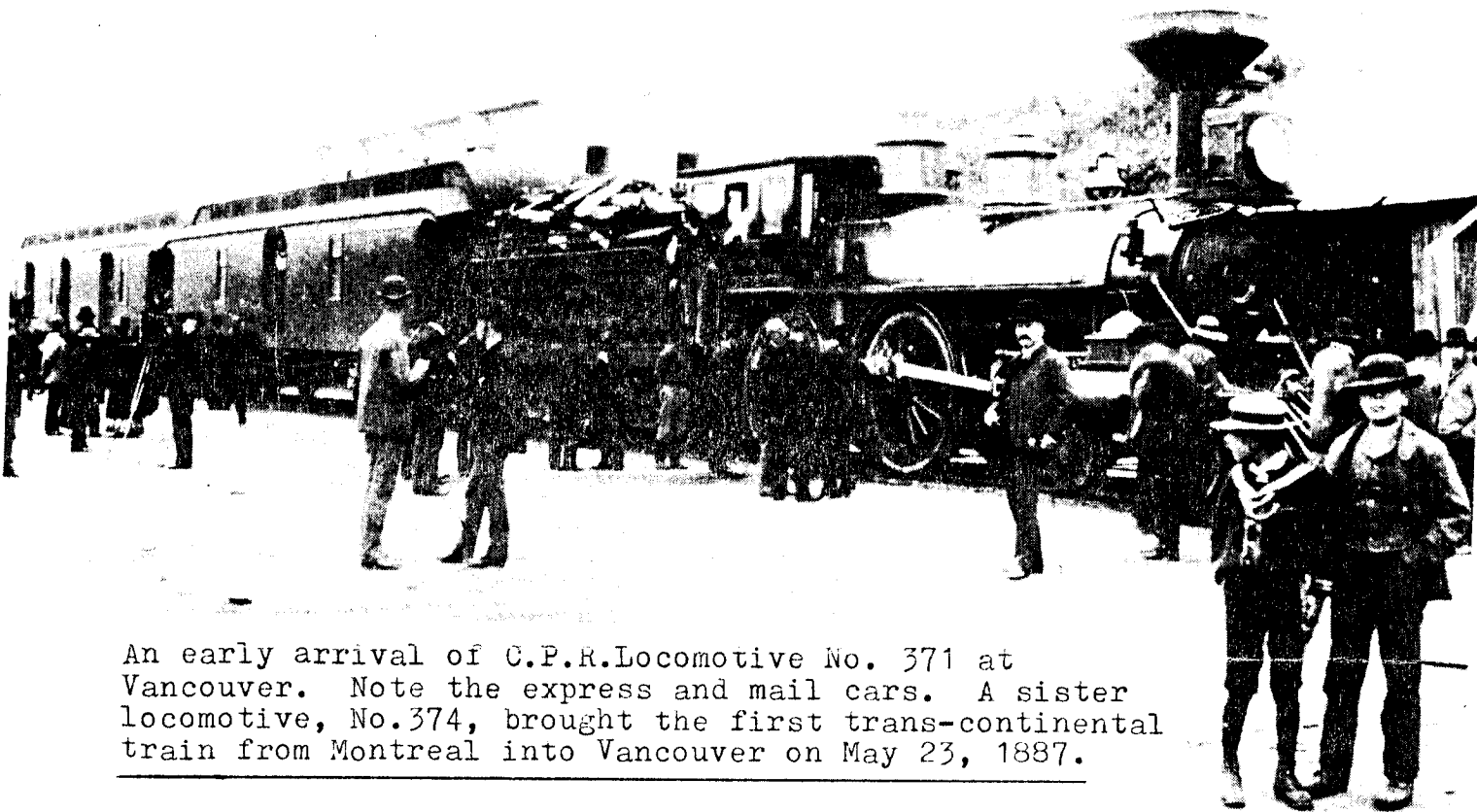
An early arrival of C.P.R. Locomotive No. 371 at Vancouver. Note the express and mail cars. A sister locomotive, No. 374, brought the first trans-continental train from Montreal into Vancouver on May 23, 1887.