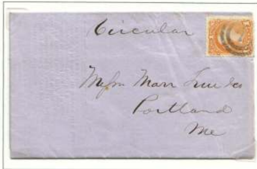
St. John, NB dated Sep. 3, 1870 to Portland, Maine