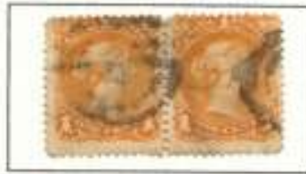
First class domestic letter, 3c per ½ oz

There are only five recorded mint multiples beyond pairs: a block of 6, two strips of 5, a block of 4 with imprint, & two blocks of 4 from adjacent positions. Used multiples are known in two strips of 6 (one on cover), and strips of three; one is shown in this exhibit. Pairs are uncommon.