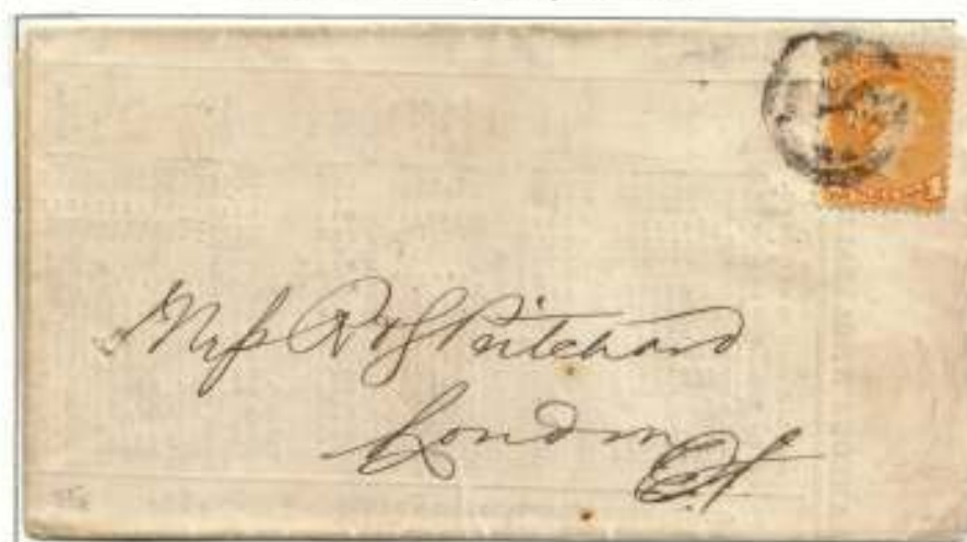
1- Circular to London, SEP 6, 1869 receiver