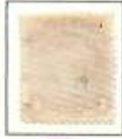
very thin wove paper Pack 9b