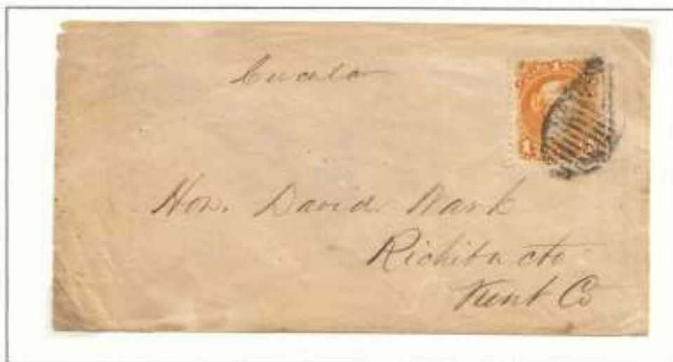
13 - Fredericton