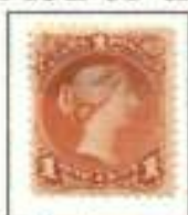
1c Brown 1868 mint og

This one-frame exhibit shows the philately of the 1 cent yellow stamp of Canada issued in 1869. This stamp was a replacement color for the original 1 cent stamp issued in brown in 1868. Confusion between the 1c and the 3c stamp, red but with many shade variations, caused confusion and led to the color change.