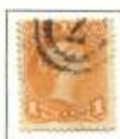
7- St. John, NB