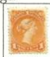
1c Yellow 1869 mint og

The stamp was replaced in less than a year with a new issue in a smaller size. Shown are aspects of production of the 1c on which the stamp was based, mint and used examples, shades based on dated copies, cancels in use during the stamp's brief period of use, and various usages on cover.