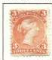
3c Red 1868 mint og