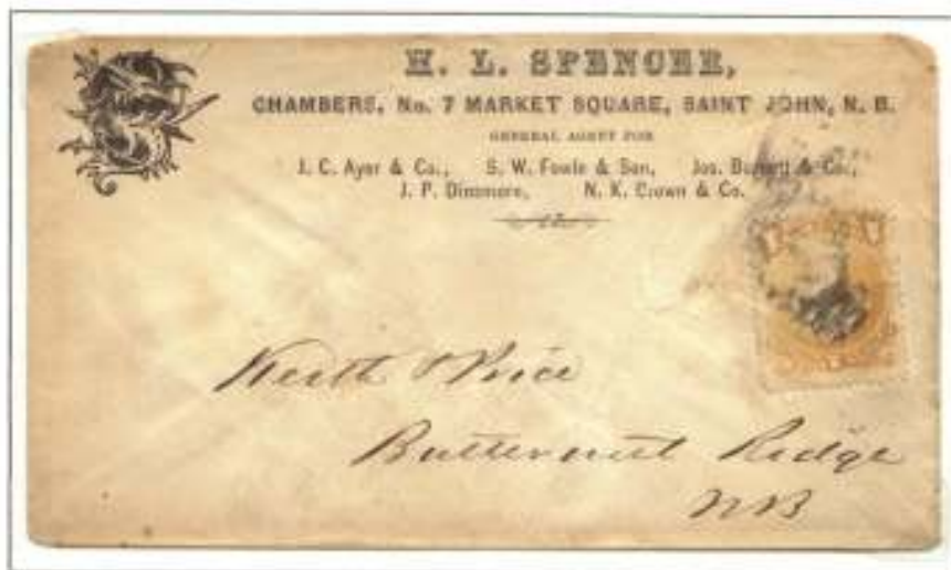
St. John, NB to Butternut Ridge, NB