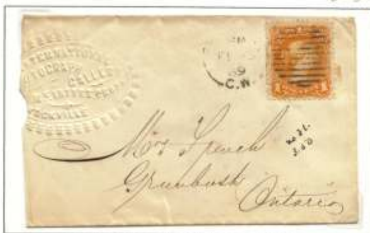
Brockville February 25, 1869 to Greenbush, Ont.