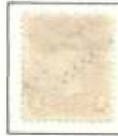
medium wove Pack 10