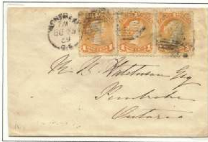
Montreal OCT 25, 1869 to Pembroke, ONT., OCT 28 receiver