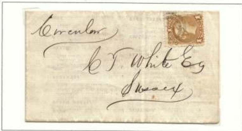
Printed listing October 4, 1870