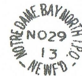
N-62Ba Page 41