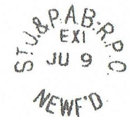
N-98 Hammer II Page 59 (N-100 AIV without outer-ring)