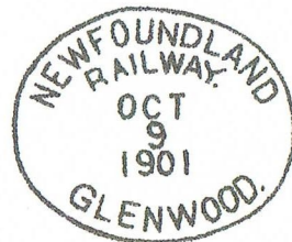
TS-180 Page 82