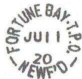
N-35 Hammer II Page 16