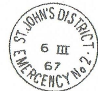
E-80 Hammer II Page 92