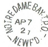
N-61 Hammer III Page 40