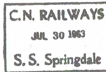
S-106 Page 87 Type 23A illustration