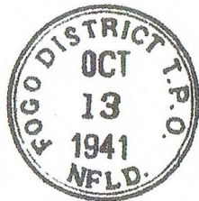
N-30a Page 15 Approx. illustration.

As previously, we have Mike Street to thank for the facility of accessing Updates from the BNAPS website, www.bnaps.org and going via the 'Book Updates' link in the 'Publications' section of the BNAPS Home Page. Please continue to send reports and comments by regular mail (note my new address given above) or electronically to briantalker63@sky.com . Colour is usually more informative than black-only copies and please include a scale measure (preferably in millimetres) with electronic scans.