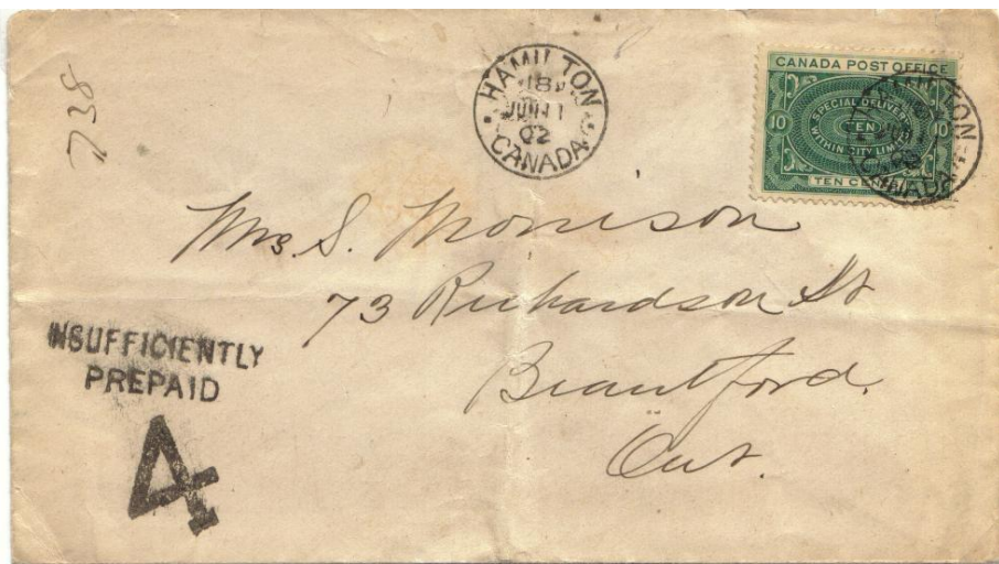
Hamilton JUN 11. 1902 to Brantford. same day receiver