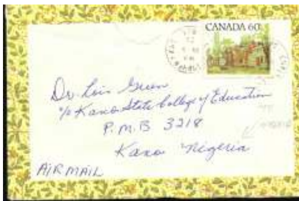
At left is a properly rated 60c under 20gr airmail letter to Nigeria from Christopher Lake, SASK, dated June 6, 1982. There is no receiver. The rate was in force for a little over 1 year, from Jan. 1, 1982 to Jan. 14, 1983. Who's got other such items? This is the classic material of Canada in 70 years.