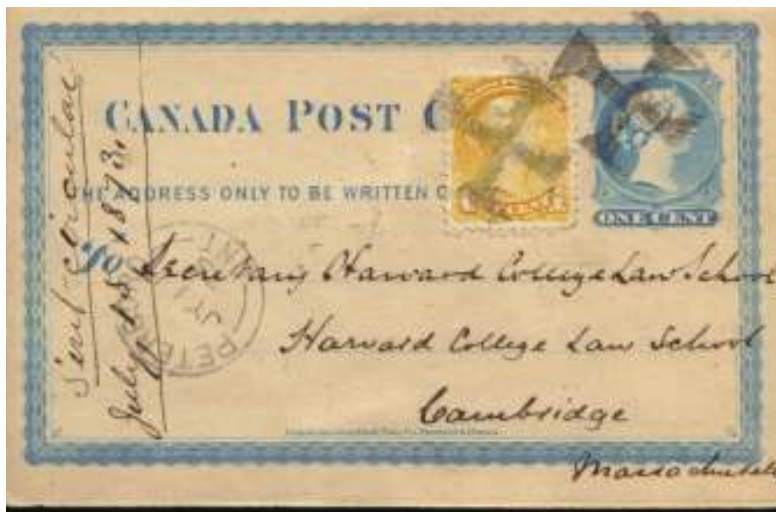
Earliest recorded 2¢ post card to US after July 1, 1873, initiation of rate, dated July 11. Nice Peterboro fancy cancel

The BNAPS Board of Directors made some hard choices regarding the budget, given the dramatic drop in income due to lower yields on Society investments. BNA PortraitS has been eliminated and its content to be placed on the web, inserted with TOPICS , or sent as separate mailings as necessitated by US and Canada law and postal regs regarding nonprofit organizations. As editor I had mixed feelings.