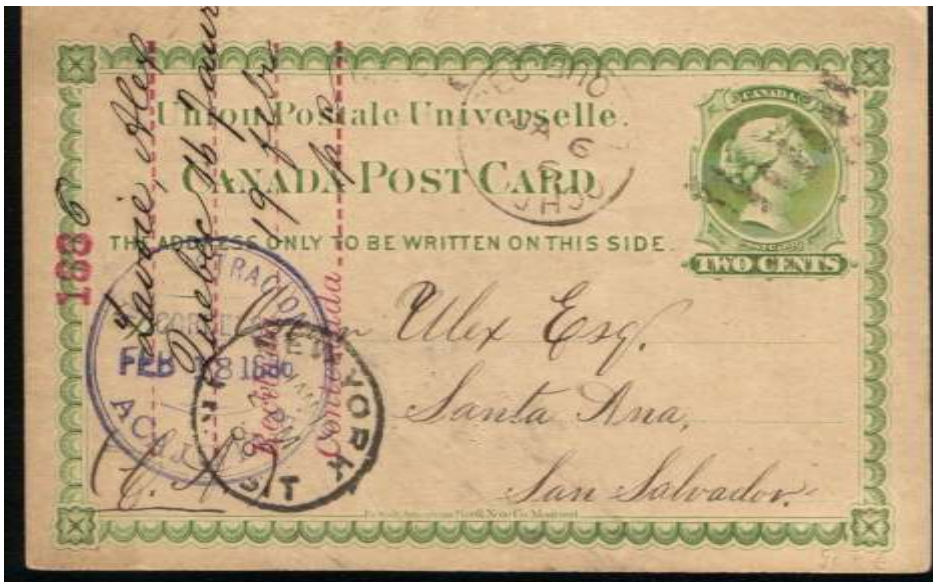
Only recorded P4 to San (El) Salvador, from Quebec City, Jan. 6, 1886

Note: countries in red not in VW collection