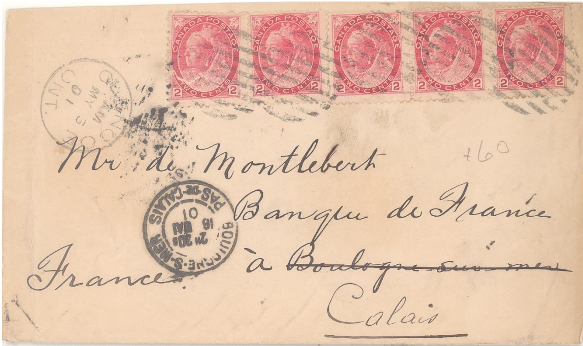
5x2¢ Numeral paying double UPU ½ oz. rate to France from Glencoe, Ont. May 3, 1901 to Calais