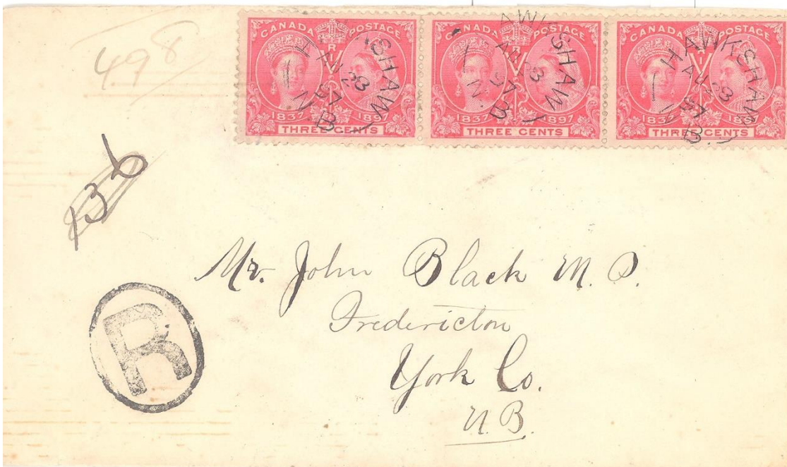
Double county 2¢ per oz. plus registration 5¢ from Hawkshaw (York Cty) NB to Fredricton (York Cty) Aug. 28, 1897 (yes, could be 1¢ overpayment of single 3¢ rate, but NB and NS continued the old provincial county rate throughout the 19 th century contrary to regulations, with many examples known)

Beaver Chatter is the unofficial newsletter of a bunch of BNAPS members who, through no fault of their own, happen to live in the state of Texas. Opinions expressed are those of the authors who like to put their thoughts, philatelically or otherwise, into writing. Unless noted, articles are the effort of the Editor. Distribution is free to BNAPS members in the area who find it worth their while to participate in the group's activities, to certain BNAPS officials, and to whoever strikes the Editor's fancy. Newsletters are available to editors of other publications who wish to exchange samples of their labors. Articles, opinions, and general BS are solicited for publication by anyone who cares to write, and contributors will be rewarded with a complimentary copy of Beaver Chatter . Submissions can be sent to Vic Willson, P.O. Box 10026, College Station TX 77842 or emailed to lloydwill@aol.com or v-willson@tamu.edu