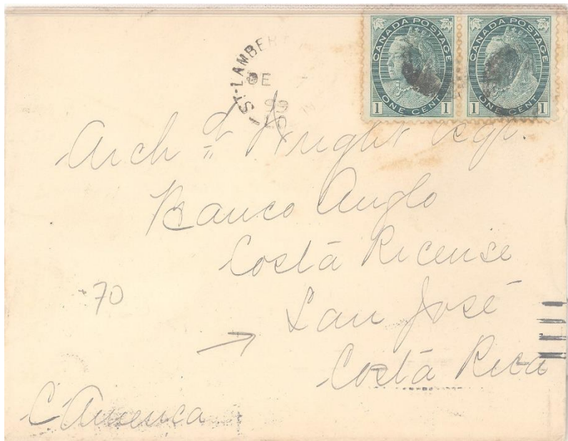
Double weight printed matter to Costa Rica (no it is not missing a 3¢ at the left, and the back flap is free for inspection) 2x1¢ Numeral, St. Lambert, Que. Dec. 7, 1899 to San Jose

In adding to my usages of 19 th century Canadian stamps I have been on the lookout for multiweight frankings, especially foreign mail. I assumed these would be easier to find in the late 1890s than for earlier periods, which are scarce to rare and costly. I have been surprised to find that even though rates came down for many destinations, especially the British Empire, on Dec. 25, 1898, from 5¢ to 2¢ per half oz., it is difficult to locate it. The UPU double rates of the period remain expensive, and triple rates mostly cost in four figures. Shown below are some recent acquisitions in pursuit of multiple weight items