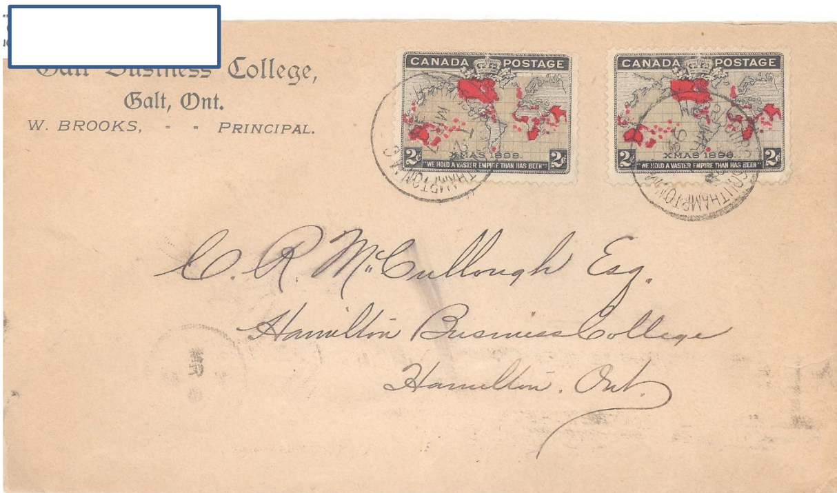
Pair of Map stamps paying double domestic 2¢ per oz. rate post-Mar. 31, 1989, from Galt, Ont. Mar. 8, 1899, to Hamilton