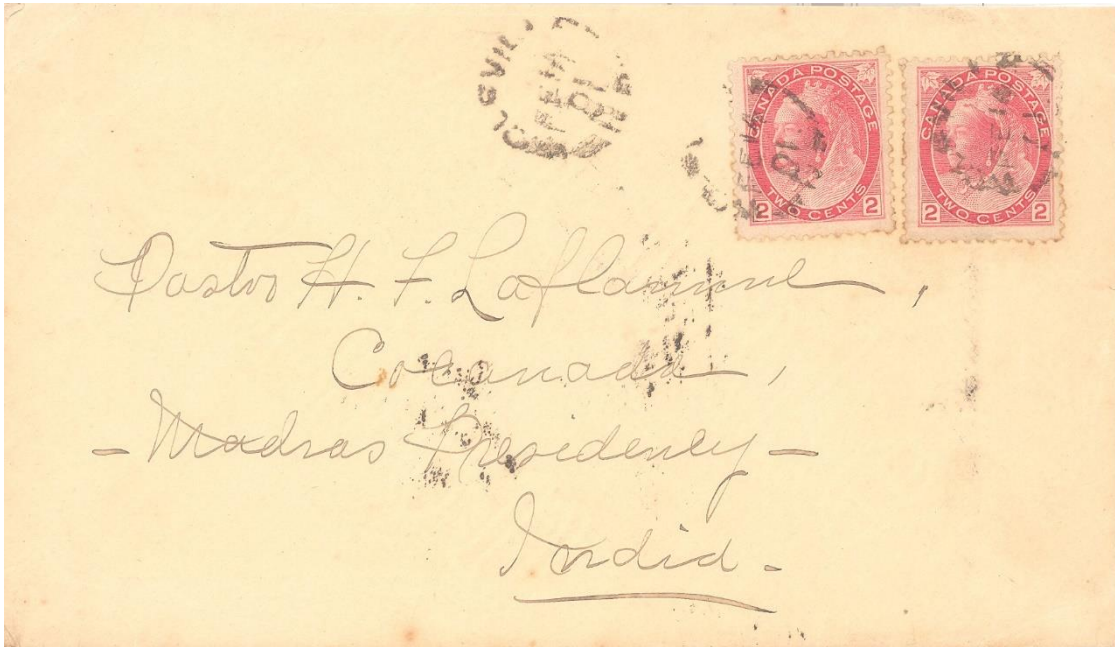
Double 2¢ per ½ oz. Commonwealth letter rate post Dec. 25 1898 to India, from Wolfville, NB Feb. 1?, 1901 to Madras