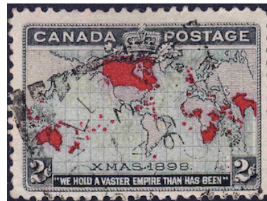
Woodville -/JA 3/99