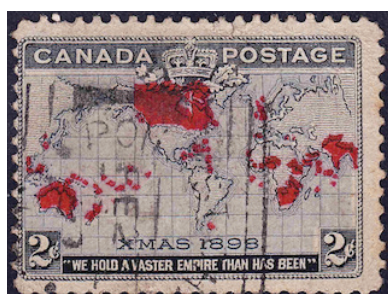
Point St. Charles -/FE 2(7?)/99