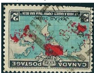
Whycocomagh AM/FE 22/99