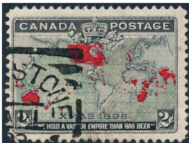
Pipestone -/A 11/99