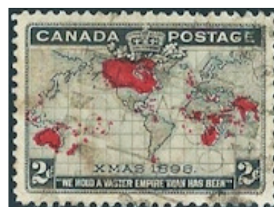
Canso -/JY ??/99