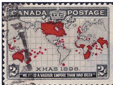
Acton Vale -/-- --/--