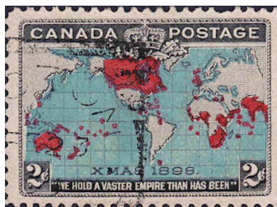
Acton -/FE 23/99