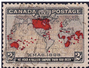
Cache Bay -/AU 23/99