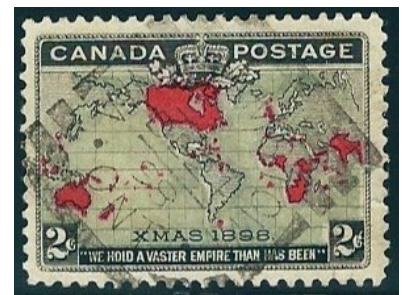
Williamstown -/DE 24/98