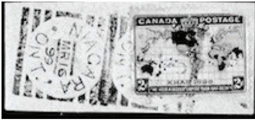
Niagara -/MR 16/99