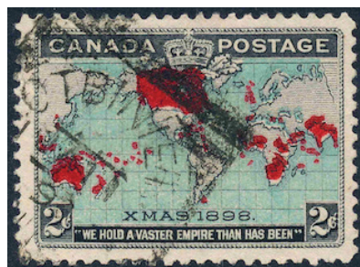
Lotbiniere -/JA 11/99