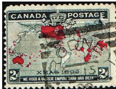
Rodney -/DE 15/99