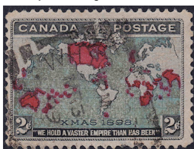
Whycocomagh PM/MR 3/99