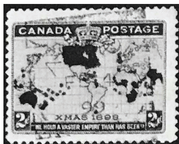
Acton -/FE 4/99