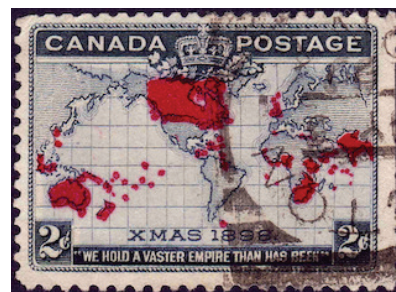
Acton -/?Y 5/99