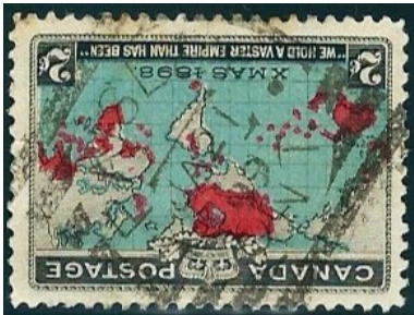
Paisley -/JA 21/99