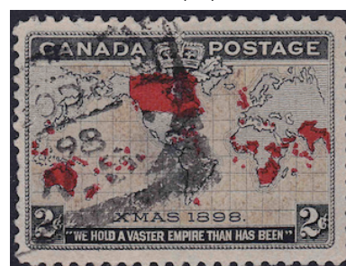
Yarmouth ?/(2?)0 DE/98