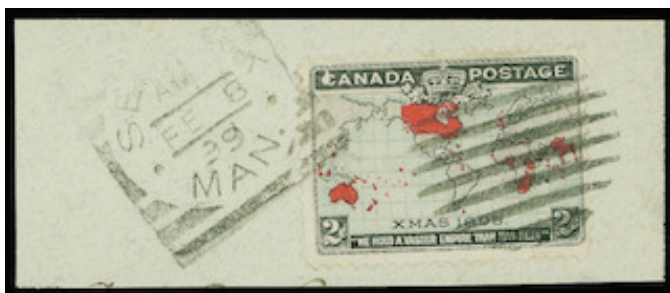
Selkirk AM/FE 8/99