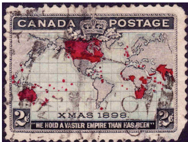
Rodney -/D- --/9-