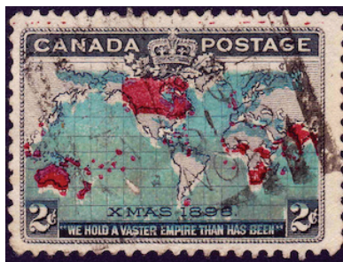
Wellington 99/?? 10/-