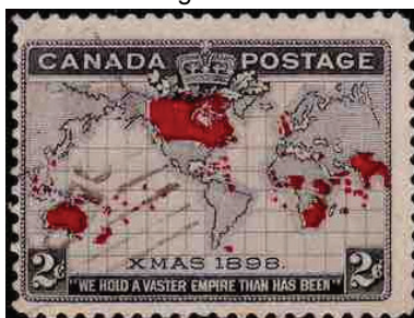
Aldergrove -/F- --/-