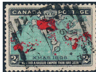
Acton Vale -/OC 7/99