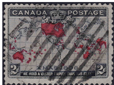
Alma -/JY 4/99