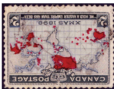
Canso -/J? --/9-