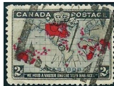
Cheltenham -/JA 10/00