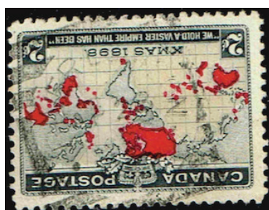
River Louison 28/99