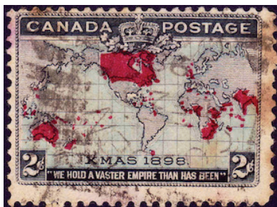
Cobden -/DE 2(0?)/98