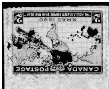
Cheltenham -/JA 12/0-