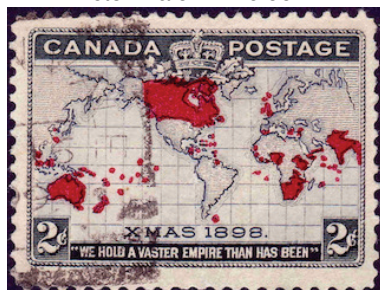
Acton Vale -/-- 16/99