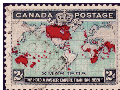
Lotbiniere -/JA --/--