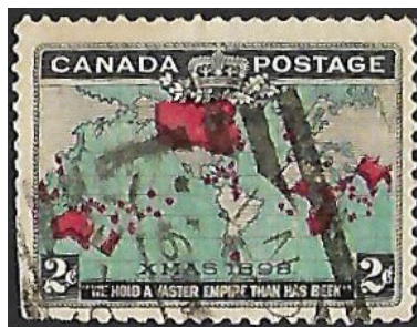
Paisley -/A 19/99