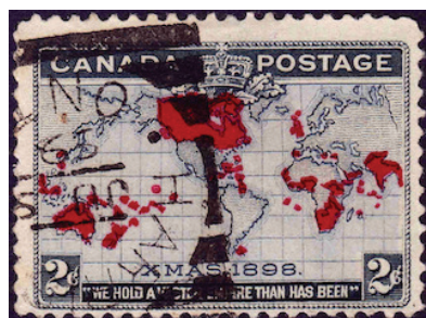
Harriston -/JU 9/99