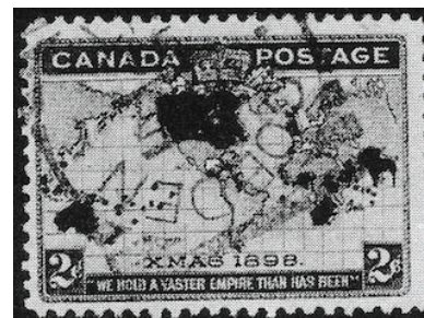
Cobden -/OC 27/99