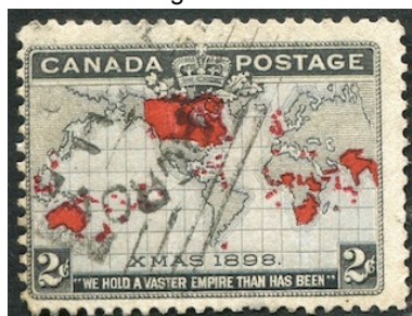
Aldergrove -/JA 11/-9