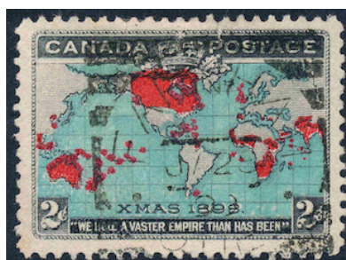
Farnham -/JA 28/99