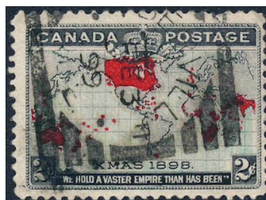
Iberville -/FE 3/99