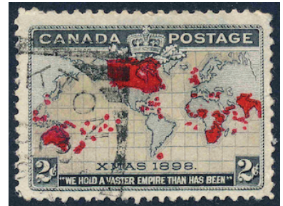
Rockton -/P 13/99