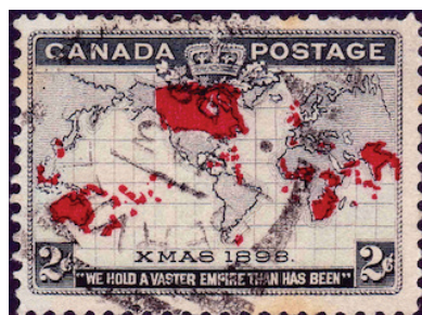
Iberville -/JA 3/99