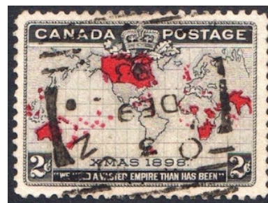
London 3/DE 9/98