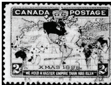
Selkirk AM/JA 3/??