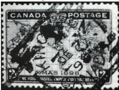
Kingston 4/DE 7/98