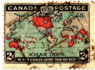
Orillia -/JA 26/99