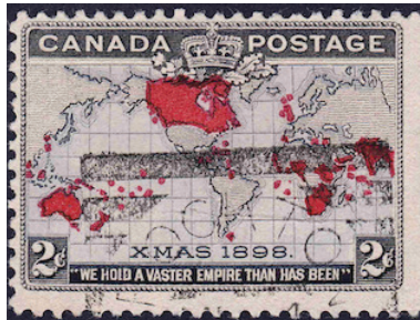
Rockton -/MR 4/--