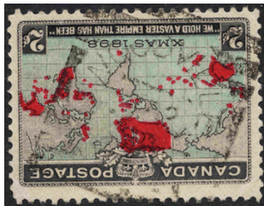
Woodville -/?? 2/??