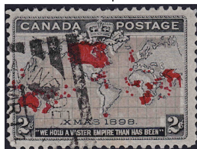
St. Anne de Beaupre -/MR 14/--