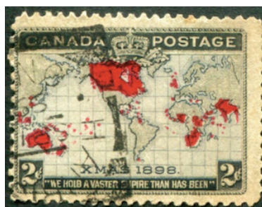
Harriston -/SP 1-/99