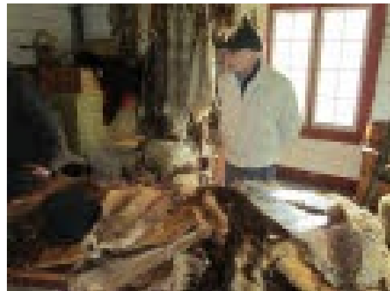
Fur Trade at Fort Langley