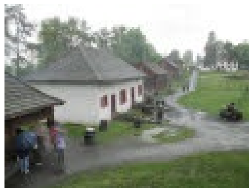
At Fort Langley