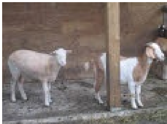
Goats at Fort Langley